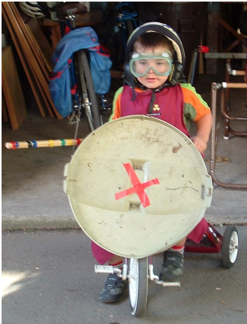
Le Chevalier de la Croix Rouge